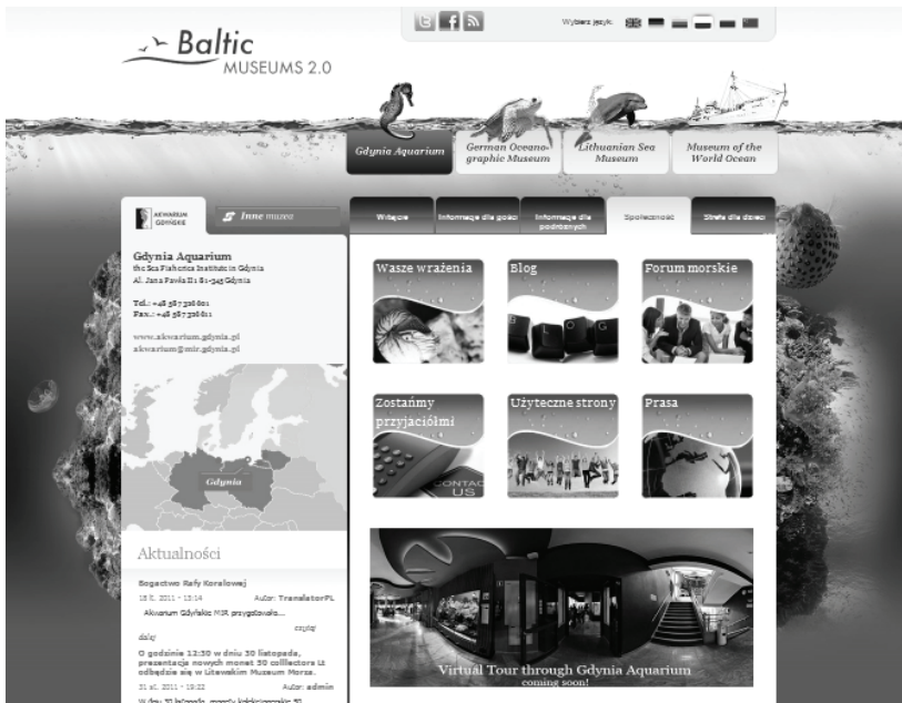
Figure 2. Main page of the Online Information Platform