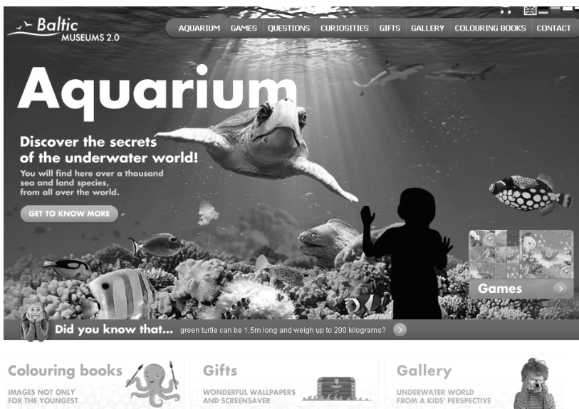
Figure 3. Main page of the Online Information Platform Kids' zone

From the very beginning of the OIP development it has been decided that the platform should offer some content specially designed for child visitors. Originally planned to be published in the same layout as the remaining OIP content, it eventually evolved into a separate website (the Kids' zone) with its own layout and graphics (see Figure 3).