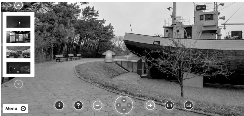
Figure 4. An exemplary panorama published at the Online Information Platform