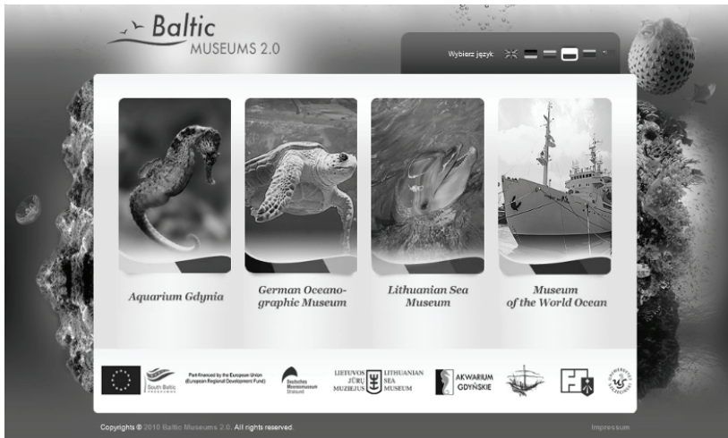
Figure 1. Entry page of the Online Information Platform